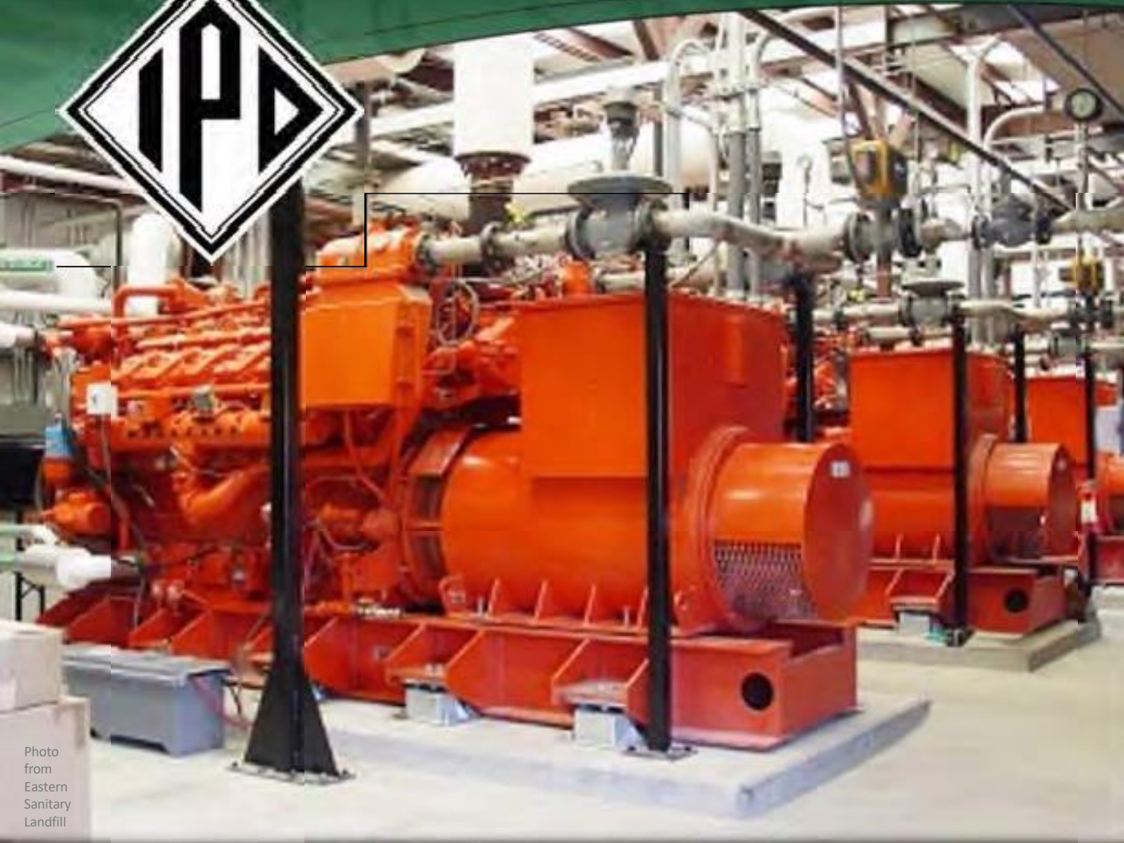
Photo from Eastern Sanitary Landfill