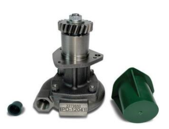
2279850 – G3300 Auxiliary Water Pump