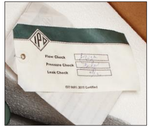
The signed tag proves every pump is personally inspected for leakage, pressure and flow