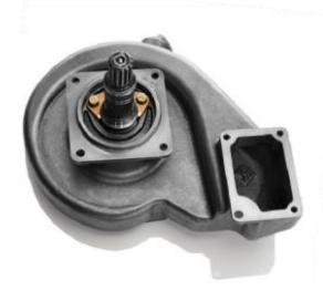
<u>4160609</u> – Cat 3500 Water Pump