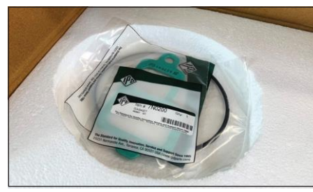
Each pump comes with a seal kit (gasket and o-rings) to help with your installation.

Buy new or rebuild – now you can purchase the water pump parts you need to rebuild your IPD water pump and make it function just like it's brand new. The following IPD manufactured water pumps and repair kits are available. Every repair kit comes in innovative IPD packaging that keeps it free from dings, damage and dirt with the parts carefully labeled. Inside you will find an impeller, shaft, seal assembly, non-threaded plug, steel retainer, tapered rolling bearing, filter and screw made from quality materials and designed to perform for demanding applications.