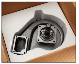
Custom foam inserts cushion pump for ultimate protection