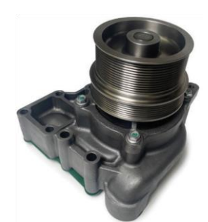
5406048 - Cummins X15 / ISX15 Water Pump