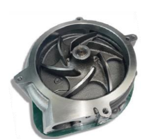
<u>3362213</u>-C15 Acert / C18 Water Pump