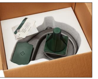
Protective cone and cap keeps debris out