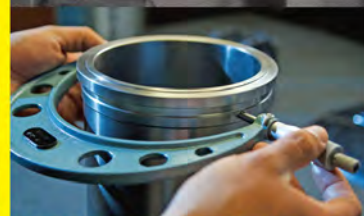
engineering & design