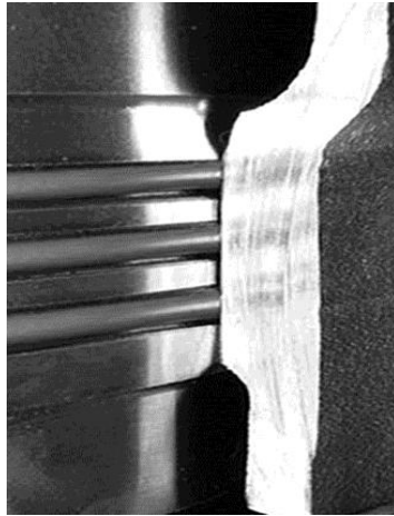
Original style cylinder liner

o-ring failure. The crevice seal cylinder liner wedges itself into the lower bore of the cylinder block, preventing the liner from moving as much as a stock liner, thus providing much higher stability under heavy loads and higher cylinder pressures. The liners in these kits have a 0.001” larger inside diameter to allow additional clearance for thermal expansion.