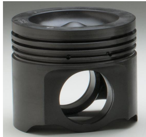
Upgrade IPDSteel® friction welded design

These new engine kits for CAT® C15 ACERT also includes IPD's innovative "Crevice Seal" Cylinder Liner. Designed and engineered by IPD to address engine block wear, this cylinder liner design includes a unique wedge shape upper crevice seal to reduce liner movement and