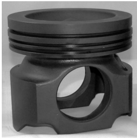
Original style 1-piece steel design

IPD's new in-frame (#KIF6615/12/CS) and out-of-frame (#KOF6615/11/CS) engine kits contain six IPDSteel® welded pistons (#3466615) with a 16:1 compression ratio. These welded pistons are manufactured in Torrance, California (USA), and are a superior design compared to 1-piece steel versions. Welded steel pistons are specified as original equipment in selected industrial applications to prevent piston scuffing in highly loaded engines.