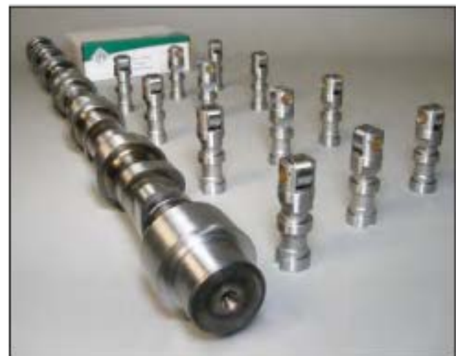
Camshafts and cam followers for popular applications. All held to the closest specifications and tolerances. More camshafts under development.

This is only a representation of our coverage, please contact your Customer Service Representative for further details. If you are an IPD Authorized Distributor, you can also access our on-line IPDNet™ parts cataloging and ordering system for up-to-date applications that are available from IPD.