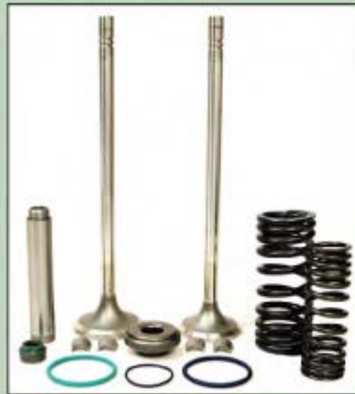
Typical parts coverage for a 3406E engine.