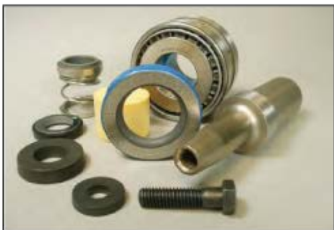
Water pump rebuild kits for popular applications.