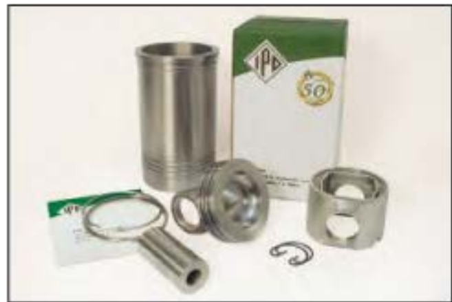
Available from IPD are popular options such as cylinder kits and in-frame/out of frame overhaul engine kits. (IPDSteel™ articulated piston shown)