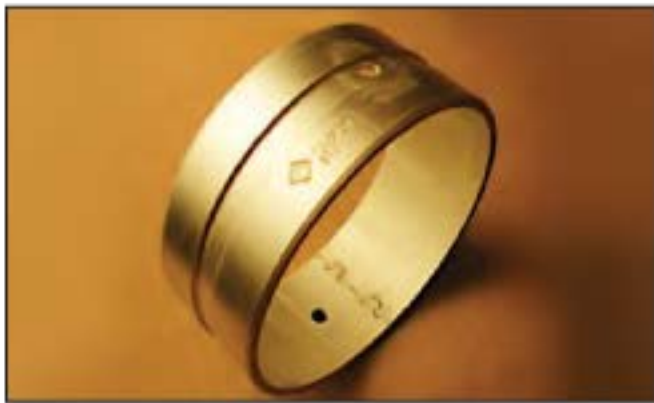
Camshaft and connecting rod bushings, including oversized camshaft bushings for popular applications.