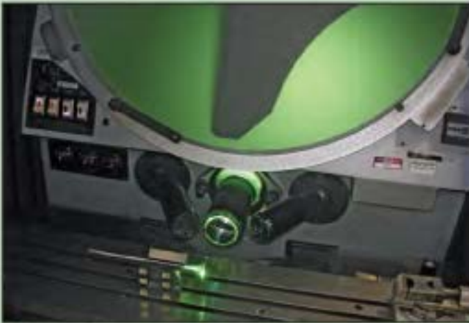
IPD valve inspected on our optical comparator.