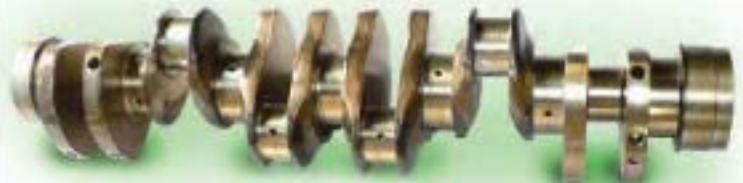
IPD offers a wide range of high quality forged steel crankshafts that receive multiple quality control checks for hardness, fillet radius specifications and straightness.