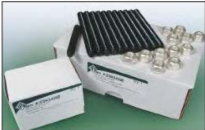
Exhaust manifold stud kits that include nuts and studs, packaged in convenient kits specific to 3406 engines. Individual parts available for 3408 & 3412 applications.