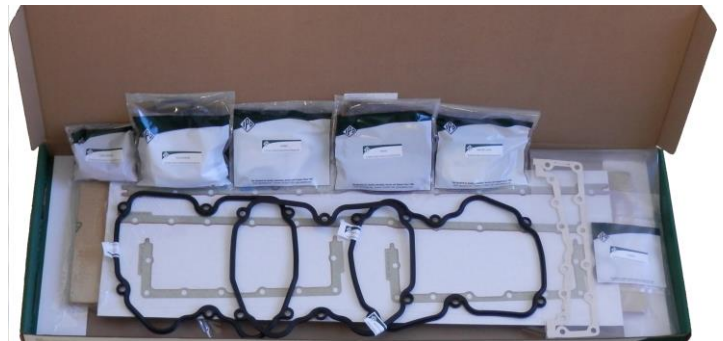
C15091NLS In-Frame Gasket Set