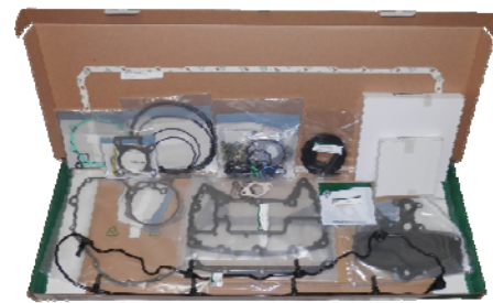
IPDStyle 1-2-3 Gasket Set for C9

A new IPDStyle 1-2-3 gasket set is now available for Caterpillar 160M graders. If you are unfamiliar with IPD style sets, you should be aware that IPD customers report that these sets save them time and money. All the components needed to complete a service repair are included in one box, all grouped and marked into logical engine service sections for added convenience.