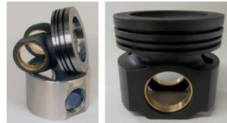
OE style 2pc vs. IPD 1pc steel upgrade

The optional IPDSteel® piston upgrade is manufactured exclusively by IPD in Torrance, California (USA). This one-piece steel piston upgrade replaces the original equipment ( #1807352 ) two-piece design (steel crown and aluminum skirt).